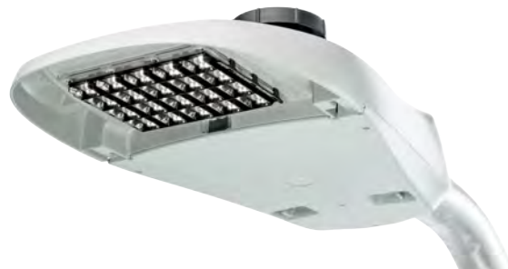
Cul-de-Sac Shield (CSS) Installed on GCJ