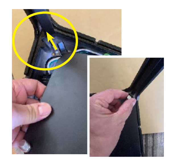
Step 11 - Optional Field-Adjustable Light Output (CS Option Code)