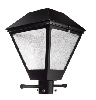
Step 10 - Reinstall the side panel lenses (if applicable).