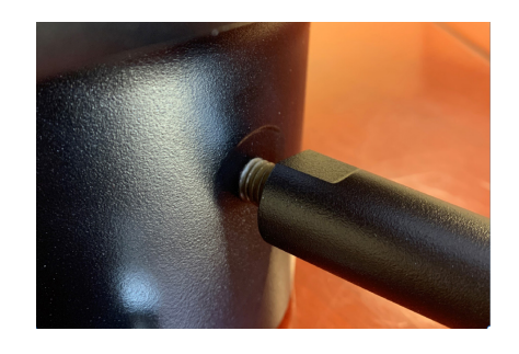
Step 14 - Ladder Rests Attached ladder rests by screwing into threaded hole.

Complete specifications are available at