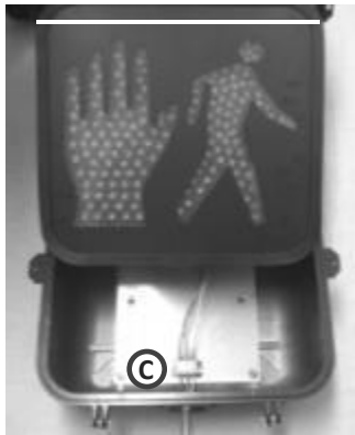
Figure 3 (C) Connection at Terminal Strip