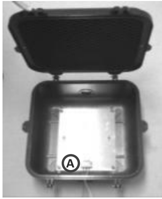
Figure 1 (A) Terminal Strip