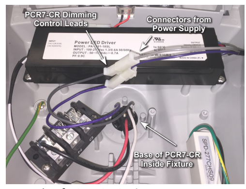
Example of PCR7-CR Option