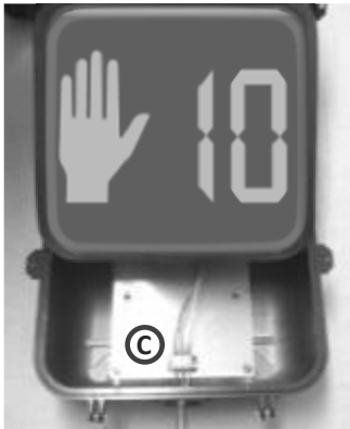
Figure 3 (C) Connection at Terminal Strip