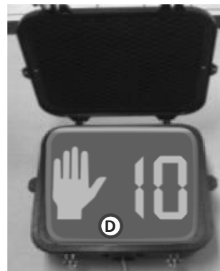
Figure 4 (D) Secure Door

Step 1 - Remove existing pedestrian glass legend and reflector/assembly unit from housing. Disconnect original conductors from the terminal strip inside the housing (Figure 1)