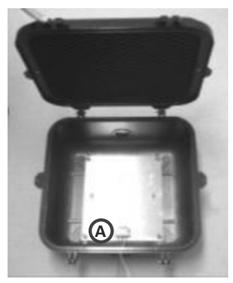
Figure 1 (A) Terminal Strip