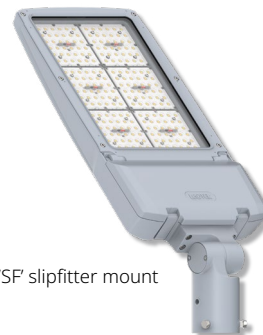
'SF' slipfitter mount