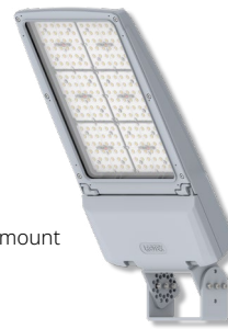
'TR' trunnion mount